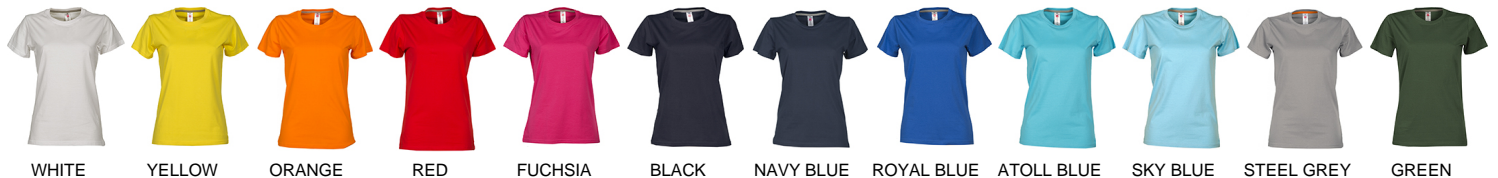
WHITE YELLOW ORANGE RED FUCHSIA BLACK NAVY BLUE ROYAL BLUE ATOLL BLUE SKY BLUE STEEL GREY GREEN